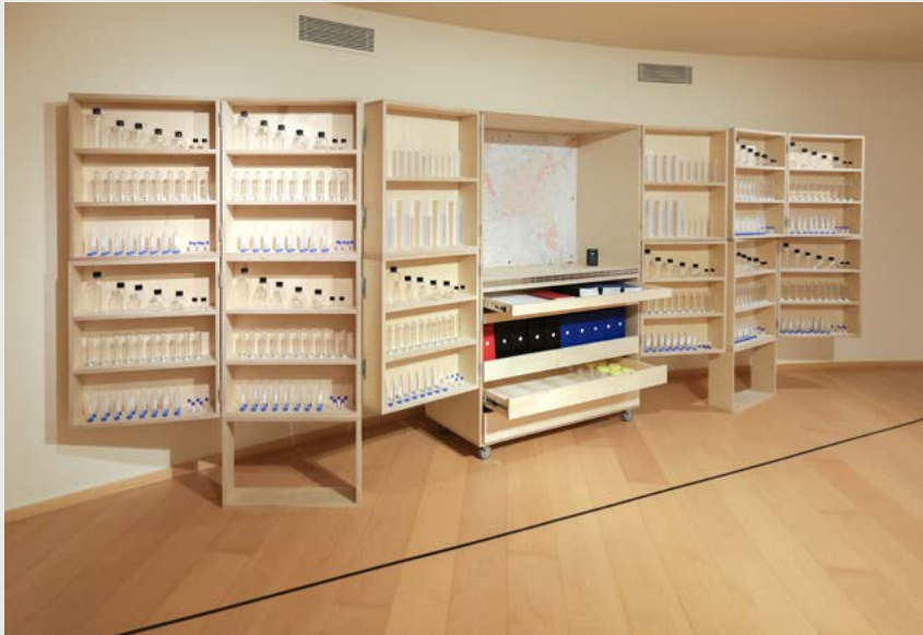
Wooden structure and objects Various dimensions